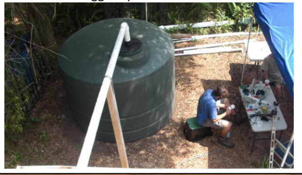
It looks a lot bigger up close. Come check it out.